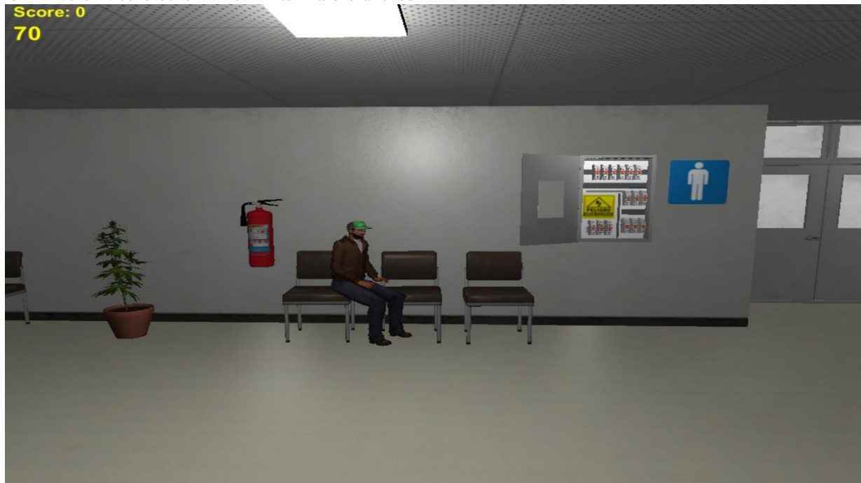
Fig 4. Implementation of a new context in JUSEGU: Verification of the electric distribution board overheating.

The generation of the DTD file, structured as elements and attributes, validates XML file syntax. It generates a simple, hierarchical file that any member of the interdisciplinary team can contribute with authorship. This allows for optimal communication between all team members in a collaborative and cooperating manner.